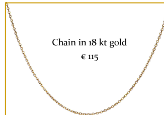
Chain in 18 kt gold € 115