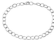
Silver bracelet (925‰) € 35