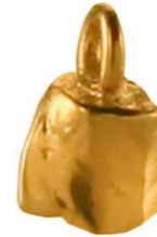
Pure gold plated baby tooth From € 199