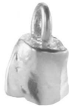
Pure silver plated baby tooth From € 169