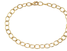
Bracelet in 18 ket gold € 230

The magical baby tooth are Made in Italy. Shipping costs for orders over €99 are included in the price for shipment by standard registered mail