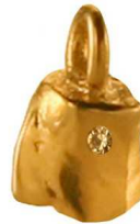
Pure gold plated with diamond From € 299